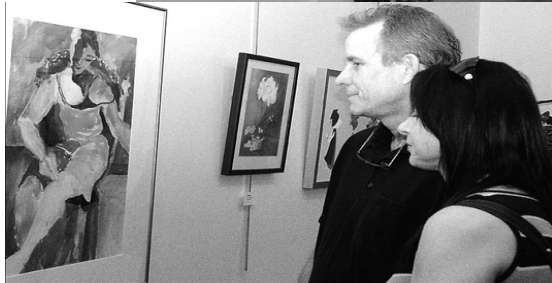
Everyone enjoyed the show at the Ratner Museum